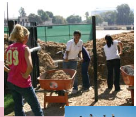
Orange County Rescue Mission

On Wednesday morning, October 3, a long line of buses pulled up in front of Connelly, and students, faculty and staff embarked on Connelly's annual day of service to the community. Inspired by a prayer service led by the Pastoral Ministry students, the volunteers headed out to prearranged locations throughout Orange County. In Anaheim, volunteers worked through Paint Your Heart Out to rake, mow, prune, weed and clean up two yards for residents physically or financially unable to care for them. At the Community Action Partnership Food Warehouse in Garden Grove and the Second Harvest Food Bank in Orange, many hands were put to use packing food for the hungry. Two teams cleaned up the beach at Huntington State Beach, and planted erosion control plantings at Bolsa Chica Wetlands, while others sorted and stocked at St. Vincent de Paul Thrift Shops and cleaned and helped prepare for the opening of the new Orange County Rescue Mission in Tustin. At the end of an enriching day, students enjoyed cookies and shared their stories at an all-school assembly. ■