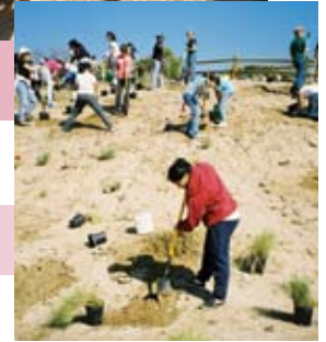
Bolsa Chica Wetlands